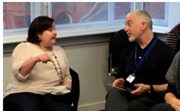
Members of the working group discuss their interpretations of transparency and engagement